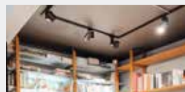
Commercial Track Light

NOTE: If you need other dimming functions, such as KNX, Bluetooth, Matter and others, please contact MEAN WELL sales team.