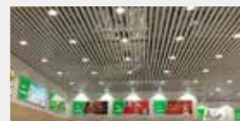
Commercial Recessed Light